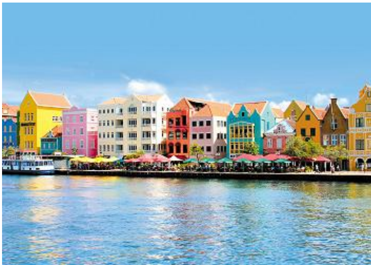
Downtown Willemstad on the Punda side, the capital of Curacao.

Opening hours' banks: from Monday through Friday 08:00 – 15:30 pm, some banks are open on Saturday morning as well (09:00 – 13:00 pm).