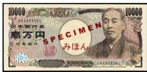
10000 Yen ( New )