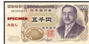
5000 Yen ( Old )