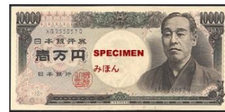
10000 Yen ( Old )