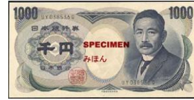
1000 Yen ( Old )