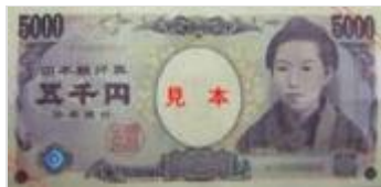
5000 Yen ( New )