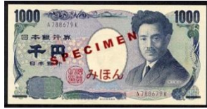
1000 Yen ( New )