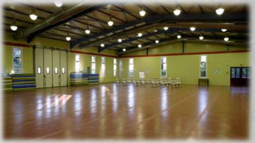
One (1) indoor hall of 550sqm for multiple use, mainly addressed to martial arts