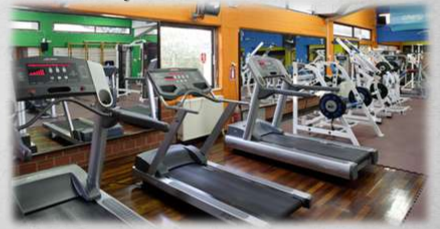
One (1) gym facility of 500sqm, with free weights and cardio equipment (bikes, treadmills, ellipticals)