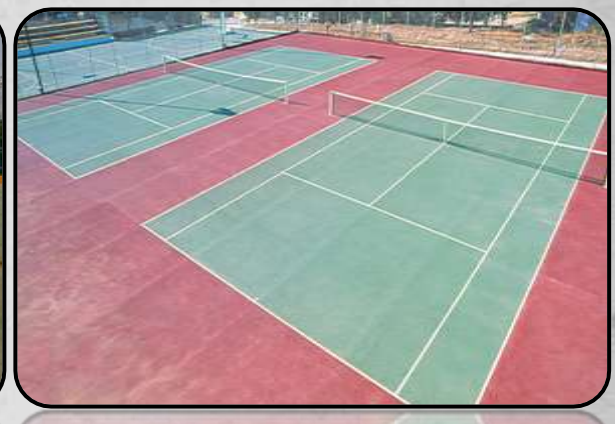
Three (3) quick surface tennis courts with lighting