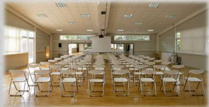
Conference room able to accommodate 150 persons (TV, audio equipment, projector)