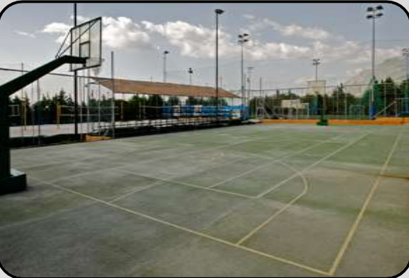
Three (3) outdoor basketball courts