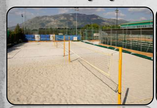
Six (6) beach volleyball courts