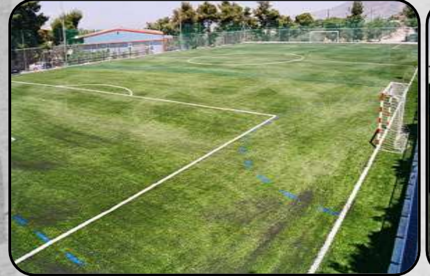
Football fields all equipped with surface of the latest generation and full lighting