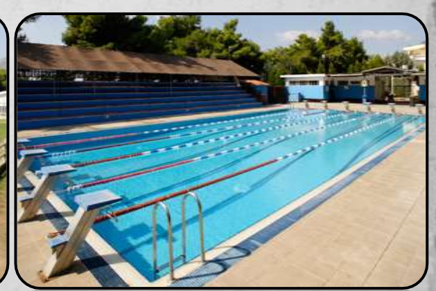
One (1) 25m heated pool and one (1) training pool 12x6m