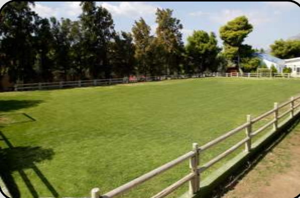
One (1) football field with natural grass