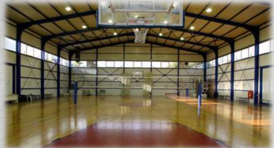
One (1) fully equipped indoor hall of 900sqm and wooden surface