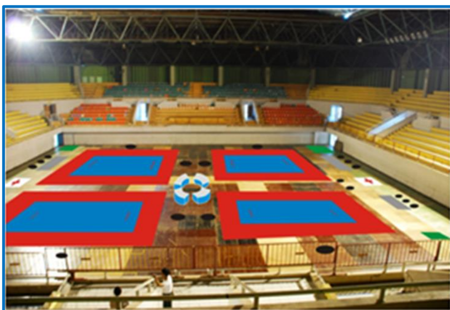
Inside Tennis Indoor, Sport Centre Senayan.