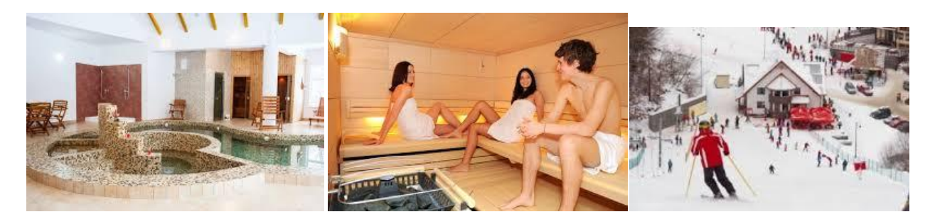
Sugas Bai, jud. C Sugas Bai, jud. Covasna 9 km de la oras

http://www.uvisitromania.com/tourist-attractions/covasna/spa-resort---sugas-bai-id407