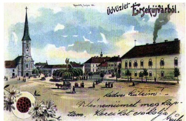
The main square with Catholic Church in 1899