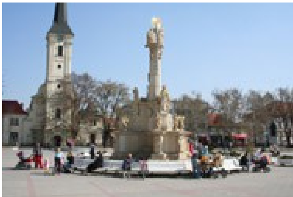
The main square with Catholic Church in 2012

The town of Nové Zámky was mentioned for the first time in 1545 as a defense stronghold against Turkish raids. The original rectangular layout was with four auricle bastions. Several years later a new castle was built on the opposite bank of the river Nitra – the present name of the town is derived from the castle. The castle known also as Castrum Novum was built in the regular hexagonal star-like layout. It had six multifloor bastions from which only the names have been preserved – Žerotin's, Fridrich's, Caesar's, Czech, Ernest's, and Forgach's. In the dramatic struggle between the Habsburgs and Turks the castle got into hand of Turks in 1663 who cruelly ruled there until 1685, when the territory of the town was conquered back by the army of Carl of Lotharingie. In 1691 Esztergom Archbishop Gyorgy Szécsényi issued the document granting town's and other important privileges to Nove Zámky. Only a few monuments and buildings of this history have been preserved, though, as most of them were destroyed during the 2 nd World War between 1944 and 1945 due to three bomb-attacks. After the 2 nd World War the town was newly rebuilt. But in spite of it in the district museum Roman inscription plates and other documents about the first settlements in the town can be found.