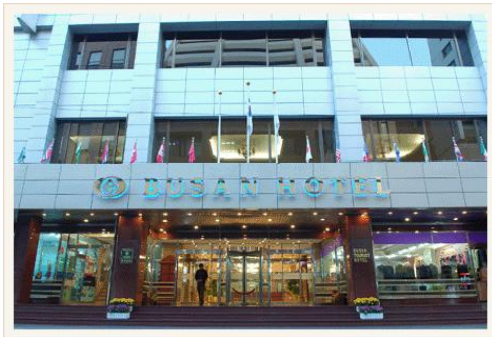
Busan Tourist Hotel

e-mail: karate-korea@hanmail.net WEB: www.pusanhotel.co.kr